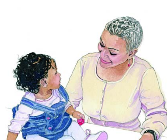
Didi giving a developmental test