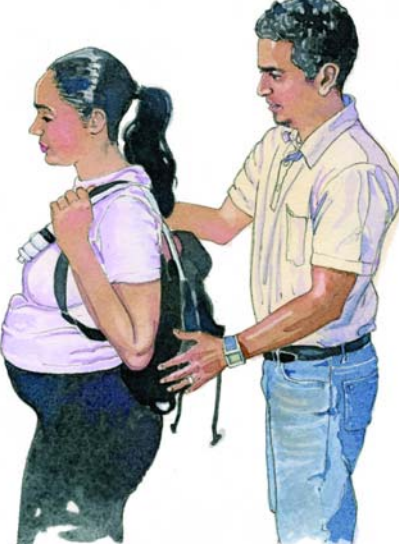
Mejico setting up mom with backpack