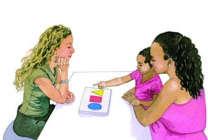
Andria giving a developmental test